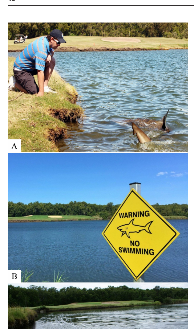
Figure 2. A) Carbrook's golf club staff with a Carcharhinus leucas in the lake of the golf course in Carbrook, Queensland, in October 2011. B) A warning sign informed the golf players about the potential risk of bull sharks in the Carbrook golf club lake. C) A Carcharhinus leucas close to the shore in 2012.

signs around the lake to inform the golf players about the potential risk (Figure 2 B).